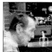
Click image for larger view.